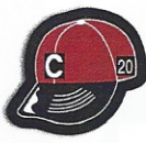
BBCP Baseball Hat