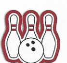
BOWL Bowling Ball with Pins