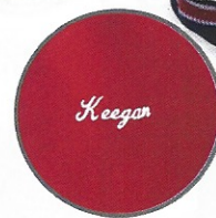
EMBROIDERED NAME (RIGHT CHEST)