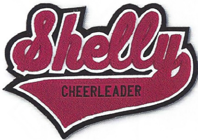
SCRIPT WITH TAIL