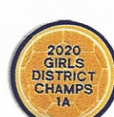
SOCC Soccer Ball Contrast Detail