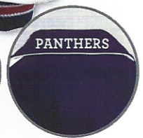
EMBROIDERED WORD (BYRON COLLAR)