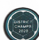
SOCR Soccer Ball