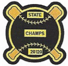
XBT3 Baseball with Crossed Bats