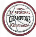
BASC Basketball Contrast Detail