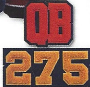
POSITION (WT. CLASS/NUMERAL)